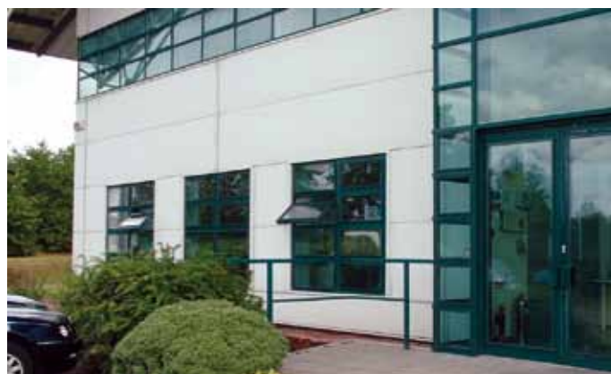
Aluminium windows and doors.