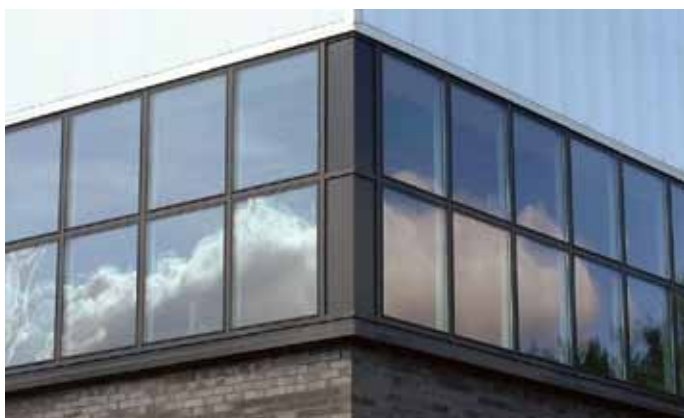
Curtain walling in a new building.