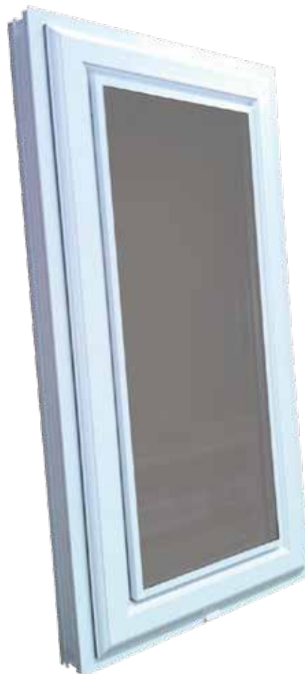
SECURI-SHIELD diagram. Windows still retain their original character.